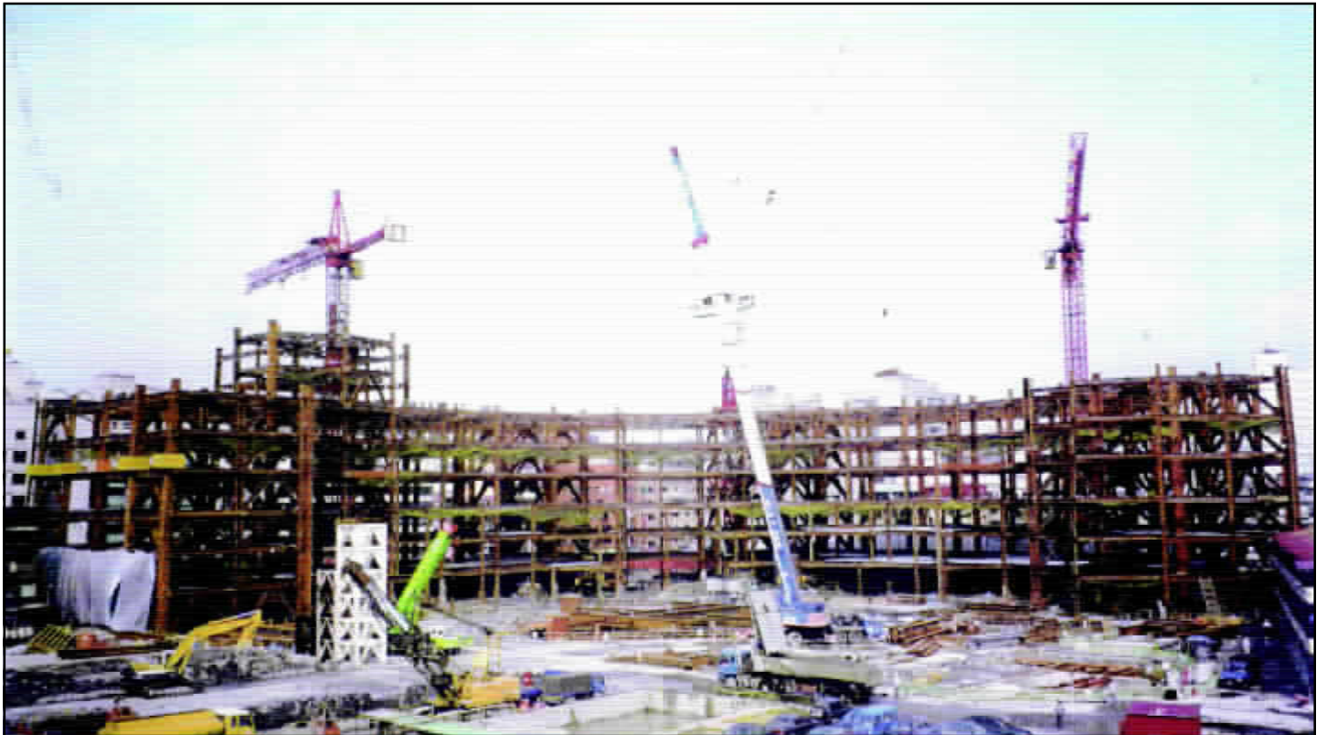
CORE PACIFIC CITY SHOPPING MALL