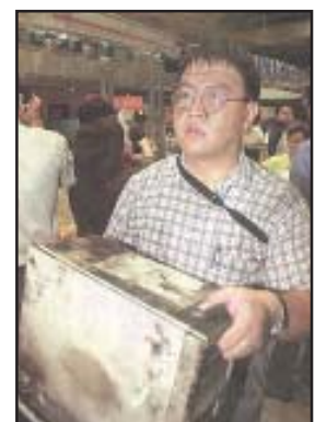
Recovery of data

1) Work force: 95% of the work force was in working mode by the middle of the week.