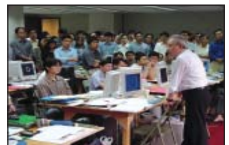
A note by the President to all MAA Taiwan staff

1) Official working date: On Monday, 28 May, MAA Taiwan has officially started work in the new temporary office location. The location is to be used for 6 months during which time MAA will search for a new office space.