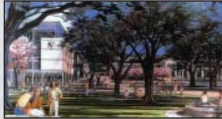
Singapore Management University

ing soil investigation work regarding the foundation and retaining systems of the proposed development.