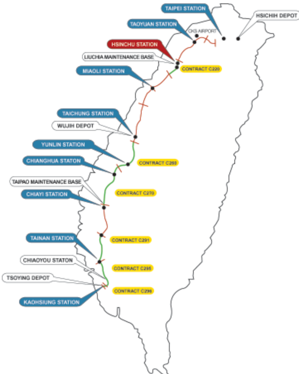
MAP OF THE 12 SECTIONS AND 10 STATIONS OF TAIWAN HIGH SPEED RAIL

Construction of the THSR is divided into 12 sections with 10 stations, 1 workshop station, 2 maintenance bases, and 3 depots. MAA was awarded the detailed design or contractors independent check of 6 sections and 1 station. Below are brief introductions of the works awarded to MAA.