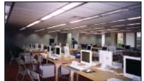
New temporary office at Hone Shee Building

1) Move in: Telephone lines, internet connection, network setup, temporary wooden tables, etc. were setup over the weekend of 20-21 May. A special appreciation should be noted here to the utility companies and the interior construction foreman for their sleepless nights to build the 120 wooden tables. By Tuesday, 22 May, three departments have moved into the new temporary office. By the end of the week, all of the departments have moved in.