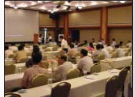
Day 1 of the strategic workshop conference

Recognizing these issues, MAA Group Consulting Engineers held a workshop, MAA Group Development Strategy Workshop on 5 th – 6 th August, 2000, to bring together employees and officers in MAA Taiwan and MAA regional offices together to discuss and brainstorm ways to meet these challenges. The two-day workshop was organized with one day of small group brainstorming session, followed by a large group discussion and conclusion. The workshop has successfully over the two days achieved many of the objectives. The most important achievement is the establishment of a common language among MAA employees, bringing forth a stronger MAA team with an international mind and willingness to uphold the civil engineering value while meeting the new challenges.