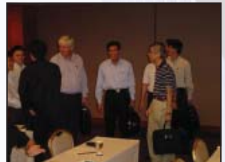
MAA regional office managers at the strategic workshop conference