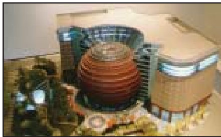
Model of Core Pacific Shopping Mall-to be opened in October 2001

In December 2000, the owner, Core Pacific City Corporation, awarded MAA Taiwan for the timely completion and outstanding planning, design and construction supervision of the deep excavation of Core Pacific City Shopping Mall. The deep excavation, 31.7 meters, is the deepest excavation ever done in Taiwan. The Core Pacific City Shopping Mall occupies a site area of some 2.66 hectares in the new central business district in the eastern part of Taipei City. The mall has a complex structure with 13 stories above ground, and 7 stories below ground. MAA was commissioned by the developer in March 1997 as the geotechnical consultant to provide services on the planning and design of foundation construction. Major works included site investigation, geotechnical analyses, evaluation of foundation construction scheme and sequence, structure floatation analysis, and design of construction monitoring system.