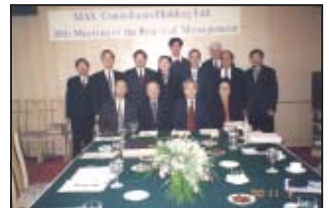
MAA Consultants Holding Ltd. 38 th Board of Management meeting.

The MAA Consultants Holding Co., the holding company of MAA Group companies, held its 38 th Board of Management meeting in Beijing on 2 nd & 3 rd November 2000. This is the first time that MAA Holding has its Board meeting held in China.