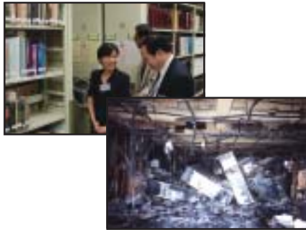
Library before and after the fire

2) Two model MAA Staff members: Two staff members have shown their exceptional bravery and behavior that deserved the utmost respect from all of MAA. They were at the office on the day of the fire see MAA's Past Announcements.